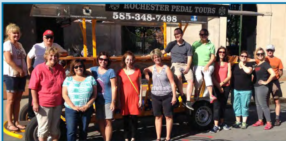
Children's Institute staff enjoyed an end-of-summer outing with a pedal tour of Rochester's architectural treasures – a unique way to learn about our city's history!